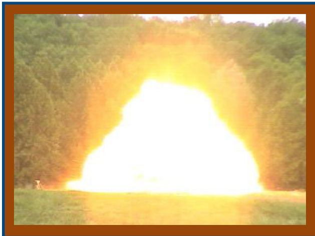
Image 1 - Blast on third day

Two ICF reaction boxes were blasted each day of the three-day show. A range of standoff distances were