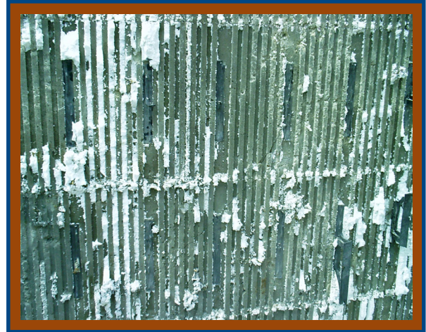
Image 5 - ICF wall at six feet

Image 4 – Specimens E (left) and F (right). Signs of compression of the EPS can be seen in the wall facing the blast of Specimen E. (Note how the ribs are only seen on the side facing the blast.) Embedded shrapnel can be seen on the bottom of Specimen E. Also, although exposed, no damage was seen to the edge of the upper slab. Reaction Box F had the closest standoff distance to the charge. The EPS was severely damaged, but the concrete maintained its structural integrity.