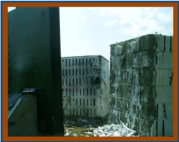
Image 4 - Blast area on May 8, 2003

The blast demonstration at FPED IV confirms the effectiveness of ICFs as a blast mitigation material. The reaction boxes at the larger standoff distance only suffered superficial damage while the ICF boxes closest to the charge maintained their structural integrity. Evidence of the compression could be seen in all reaction boxes, with the EPS dampening the force of the airblast and absorbing a considerable portion of the blast energy. Since all explosions are complex phenomenon with many factors influencing the damage to a structure, a competent design professional must consider all factors when designing a structure to withstand threats and assaults.